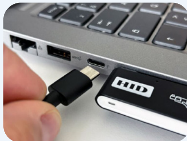
USB-C connector on the edge to keep other ports available when the reader is in use.